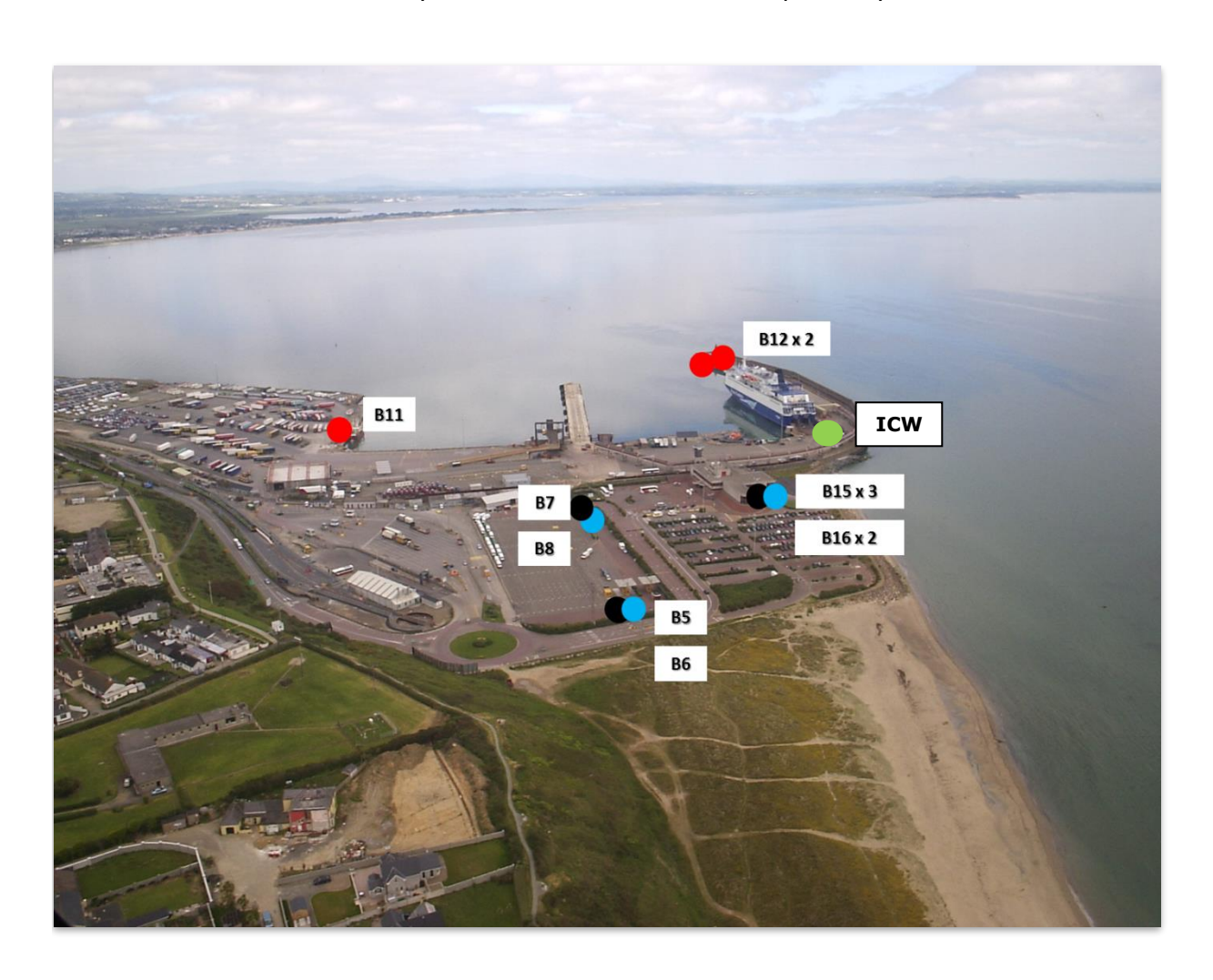
Figure 1 overleaf outlines the general facility for small boats, yachts and Fishermen to put waste ashore at the Fisherman's Quay and Berth 4 [B11 and B12 respectively]

The Harbour Master, through the normal regular contact with the Masters of Vessels and Agent(s) will keep all relevant parties fully informed of the procedures and will make copies of the plan available.